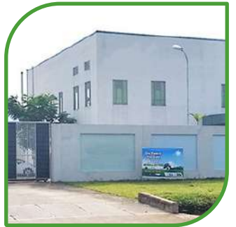
Industrial Growth Centre, Chaygaon – Patgaon – Jambari, Assam