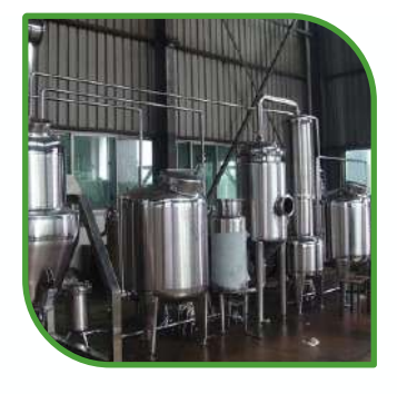
Udyog Vihar, HSIIDC Industrial Area, Gurugram, Haryana